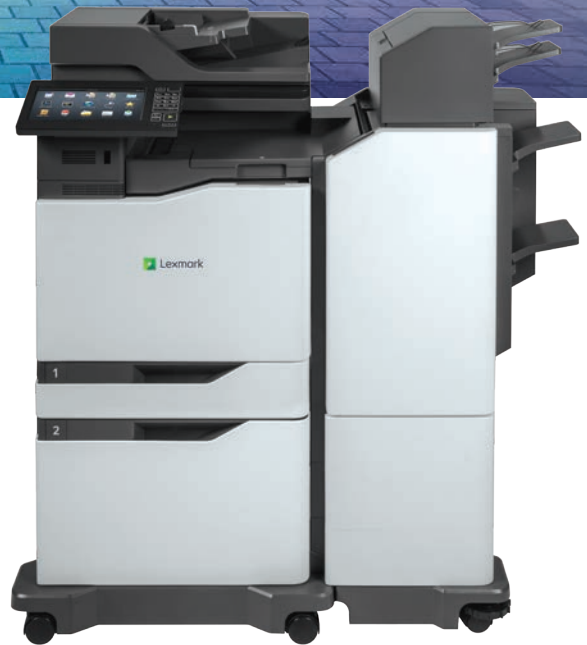
XC8160 w/ 2200-sheet tray and finishing option