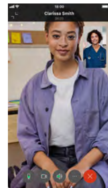
Mobile video call